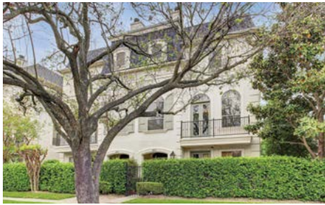
Sold 2615 Commonwealth