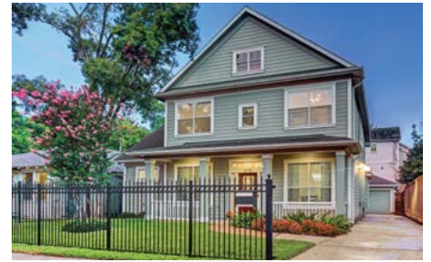
Sold 1315 Willard Street