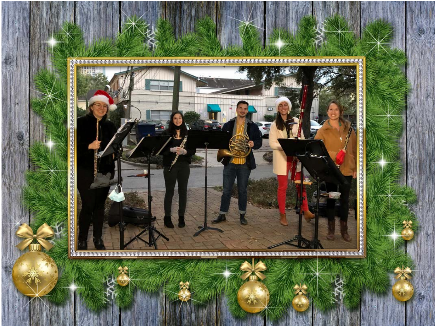
Monarch Players in Lamar Park in early December.