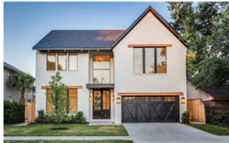
Sold 1505 Driscoll