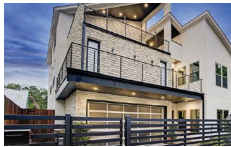
Sold 1225 Welch