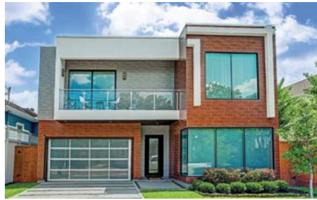
Sold 1113 Welch