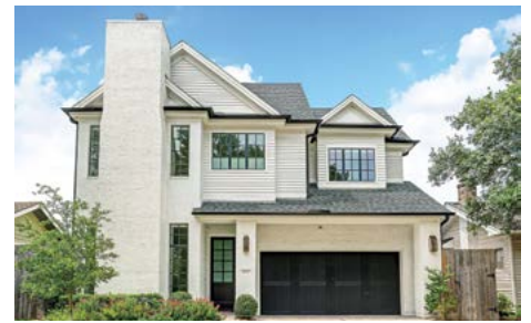
1212 Willard 5 Bed | 4.5 Bath | $1,350,000 MLS# 68541777