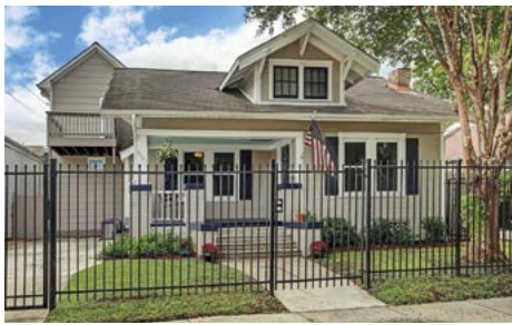
Pending 1107 Williard