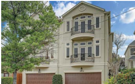
Sold 1813 Park