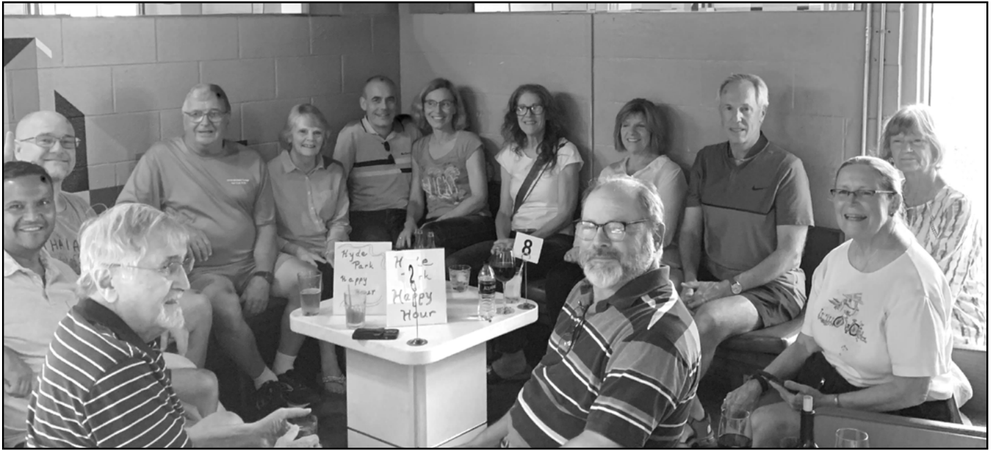
What a great group of Hyde Parkers supporting local at The Flat in August!