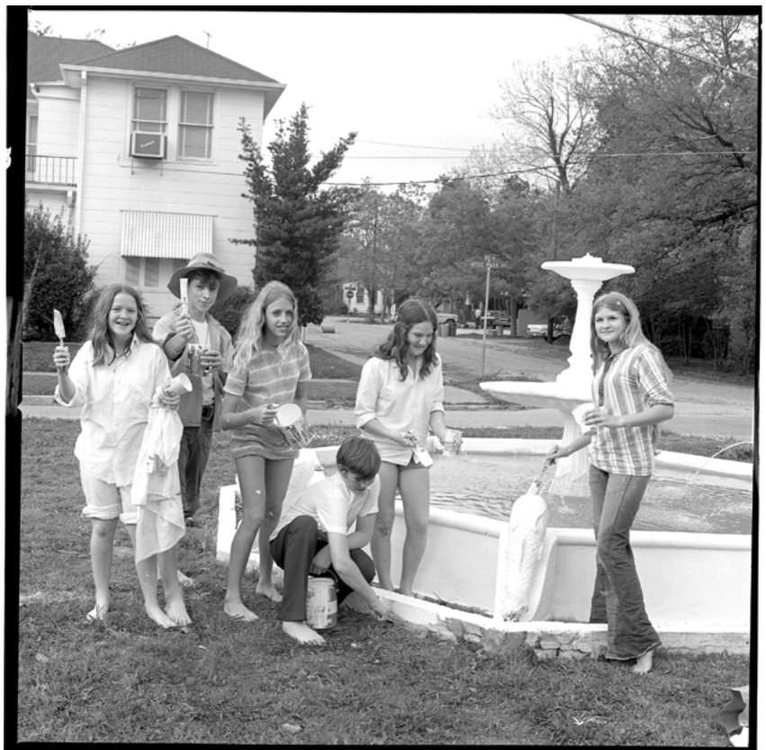
Neighborhood kids spruce up the fountain in 1972.

The fountain has had its ups and downs in the decades since, with an sympathetic plastering-over over the basin, occasional renovation and repainting (in the '90s, it had a teal, green, and grey color scheme), and long periods of simple neglect. A recent recommitment by the Houston Parks Department to its continued maintenance suggests the neighborhood will be able to enjoy this historic landmark for years to come.